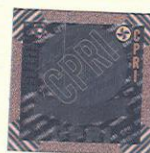
(Pradish M) Test Engineer